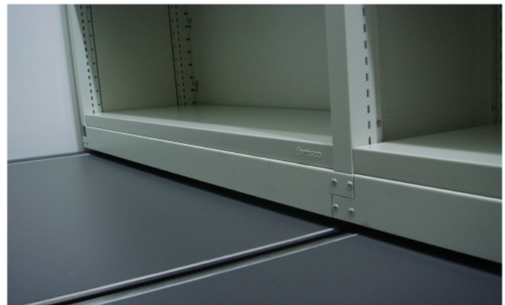
The floor panels are supported by mobile rails that form a solid platform that do not require fixing to the existing floor.