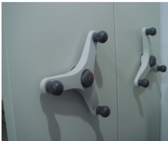
Ergonomically designed hand cranks with and without locking mechanism

By installing the shelving the length of the room rather than the width, Fortisco were able to offer Archipelago the most cost effective as well as efficient solution as the number of mobile trolleys and drive mechanisms can be reduced. The floor was installed without the need to fix to, or damage, the existing office floor